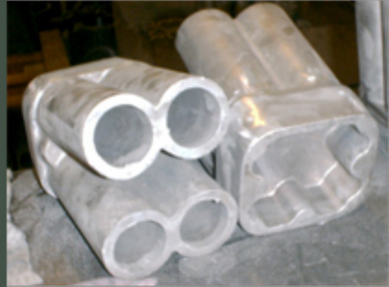
M6 Body Castings

66 mm Grenade Compatible Single or Quad Tube Inventory and Firing Connects with Vehicle Integrated Defense Systems